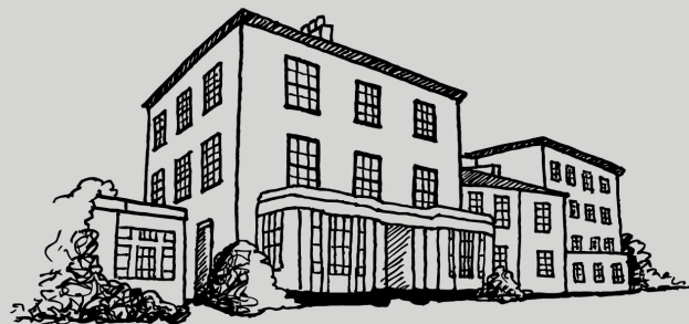
BANNATYNE HOTEL DARLINGTON